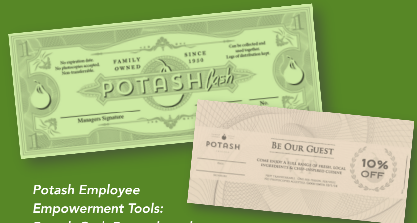
Potash Employee Empowerment Tools: Potash Cash Rewards and Potash VIP Guest Offer for employees to share