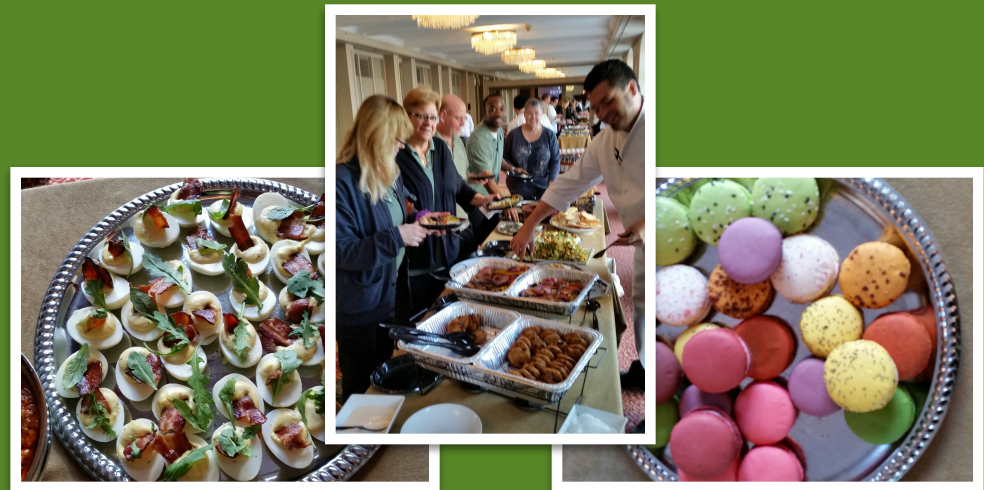
Potash Employee Rally feat. New Prepared Items