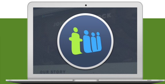
Emergent introduced Potash to Teamwork, a new collaboration platform and project management tool