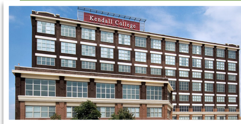
Kendall College trained Potash staff