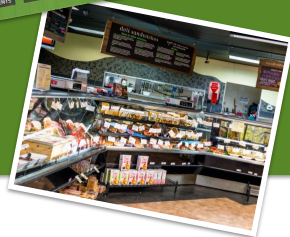
Potash's upgraded Deli at 875 N. State Street

Potash's improved Catering Menu feat. items such as deviled eggs with candied bacon & arugula, cucumber cups with crab salad, and assorted mini pastries from Alliance Bakery